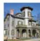
Morris County Historical Society at Anson Hall